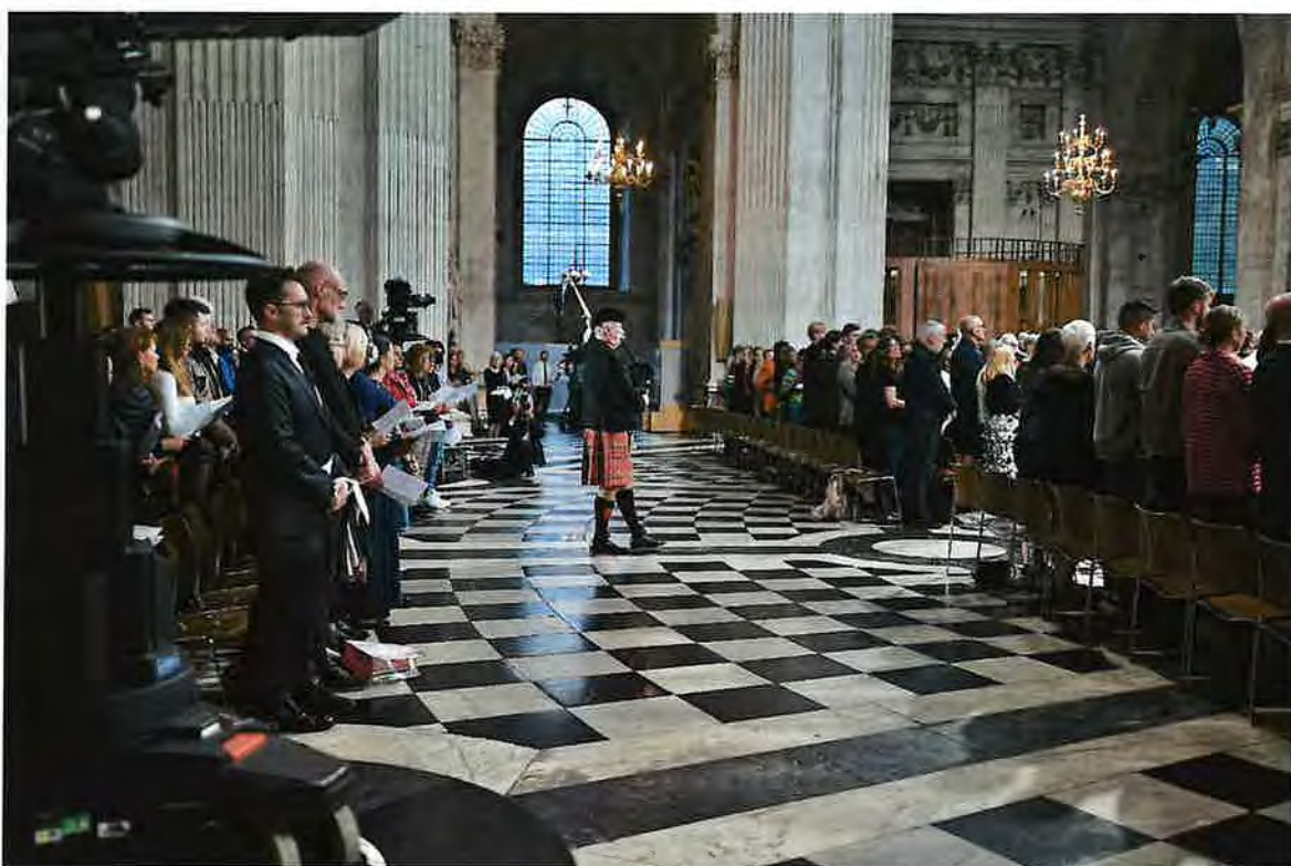
Service of Prayer and Reflection on 9 September 2022 following the death of HM Queen Elizabeth II.

In addition to regular services, a variety of special services marked important anniversaries and celebrated the work of various charitable organisations. These included The National Service of Thanksgiving to celebrate the Platinum Jubilee of Her Majesty The Queen; a Service to mark the 40 th Anniversary of the Falklands Conflict; and the Service of Prayer and Reflection following the death of Queen Elizabeth, which, like the Platinum Jubilee Service, was broadcast live around the world on both television and radio. Alongside these special services, there were a number of notable concerts including a Gala concert by the London Symphony Orchestra conducted by Sir Simon Rattle, which incorporated external performances both in Paternoster Square and on the steps of the Cathedral, and a concert on the anniversary of the first "lockdown" remembering those who died during the pandemic, as part of our "Remember Me" Memorial Project.