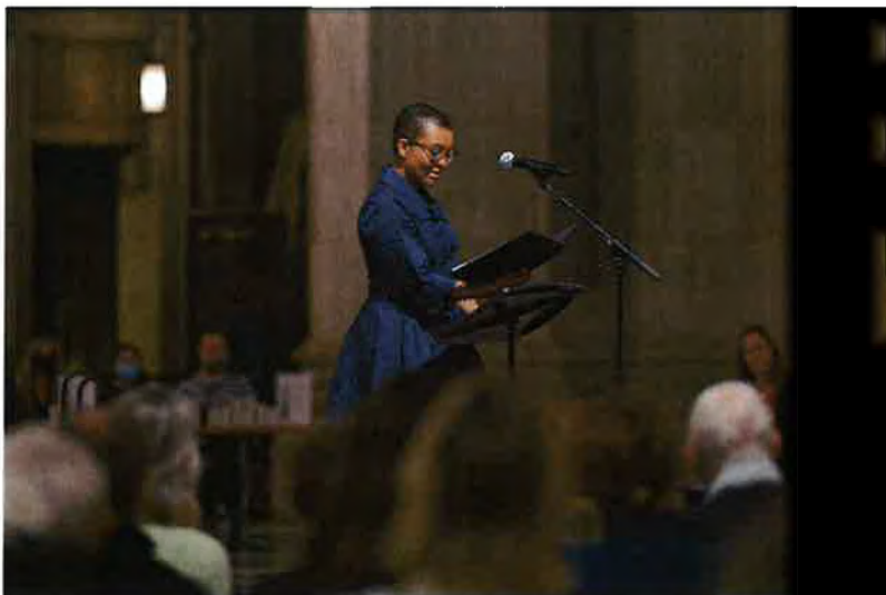
Adult Learning event on 25 October 2022 with actress Adjoah Andoh.

The schools and family learning team has seen an unprecedented bounce back in school visits for the Schools and Family Learning department. Over the year they maintained a 98.3% 'good to excellent' feedback ratings for their delivery while engaging with 22,171 school children (25,316 including accompanying adults on the school visits). The team has also been working hard to improve their offer to visiting schools, ensuring that it is fully inclusive and relevant for everyone who attends. This has been done by underpinning each session with a sensory learning focus. This means all students will be able to engage with the content through sight, smell, touch, taste and sound. The quality of handling objects is being improved to museum standard replicas and work is beginning on the supplementary materials to support schools' visits on the digital Learning Library, within the website.