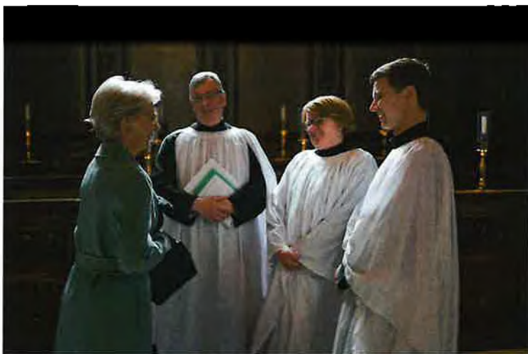
Attendance of HRH The Duchess of Gloucester on 29 April 2023 at the Friends 70 th Anniversary Service

The work of the Development Department has continued to provide vital income throughout 2022, both to specific projects and to more long-term maintenance of the Cathedral. This support comes from a wide range of sources from individual donors to corporate supporters, from our own Friends organisation to a range of trusts and foundations. Also key to the life of the Cathedral is the generosity Music Patrons and City Livery companies.