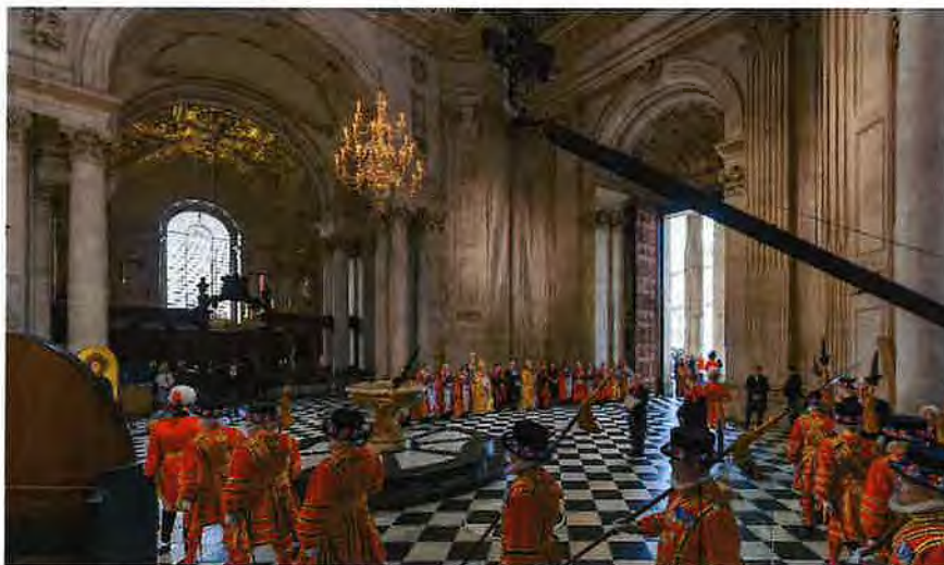
The National Service of Thanksgiving to celebrate the Platinum Jubilee of HM Queen Elizabeth II.

The daily rhythm of prayer and worship remains at the heart of the common life of the Cathedral and continues to be enriched through the excellence of our musical tradition. Numbers of people attending Services grew throughout the year and by the end of the year they were only a little below figures from 2019. In addition to regular worship a number of highly significant special services and concerts took place, most notably The National Service of Thanksgiving to celebrate the Platinum Jubilee of Her Majesty The Queen and the Service of Prayer and Reflection following the death of Queen Elizabeth.