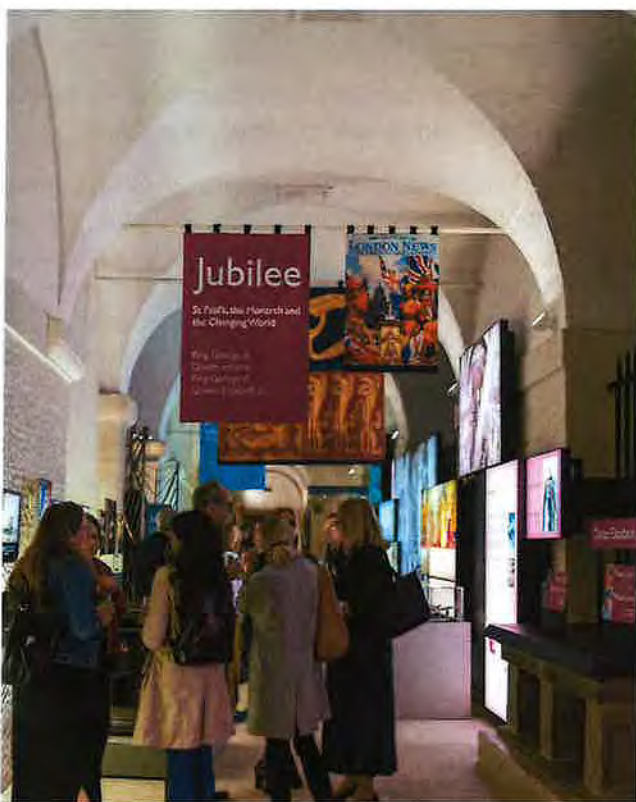
Jubilee Exhibition in 25 May 2022.

During 2022, we were visited by 547,355 sightseers, this was 56% more than we had budgeted for at the start of the year though was still 41% down on the numbers who came in 2019. Research indicates that of those visitors 53% were domestic sightseers. This represented our highest number of domestic visitors for over eleven years.