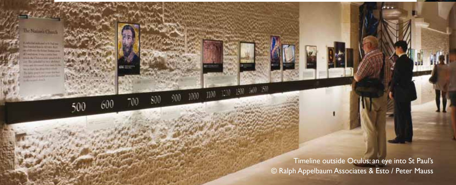
Timeline outside Oculus: an eye into St Paul's

The cathedral made further financial progress in 2010. The number of paying visitors to the cathedral recorded a small increase and the global economy continued a recovery. Net assets at the year end increased to £19.0 million (2009 £15.3 million) after taking account of a decrease in the FRS17 pension deficit of £0.73 million.