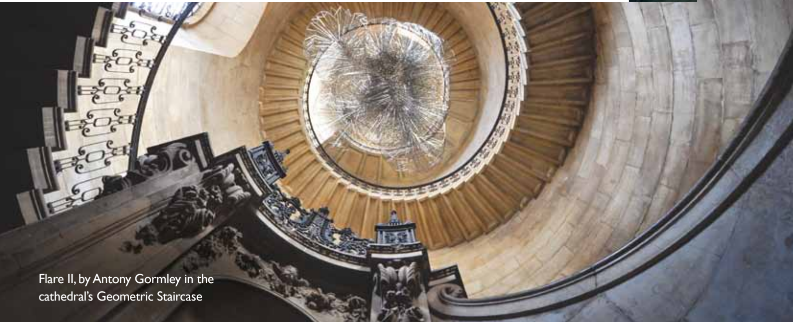
Flare II, by Antony Gormley in the cathedral's Geometric Staircase

As the tercentenary of the 'completion' of the cathedral approaches, the 15 year task of addressing the condition of the external stonework is close to reaching its end. During the past year the scaffolding has been removed from the cleaned stonework of the North Transept and a temporary ramp has been erected to give wheelchair access to the north door of the cathedral. Through the generosity of the Friends this has been made as a mock up for a possible permanent stone ramp, enabling the many interested parties whose approval will be required if it is to be realised to evaluate the proposed design as we continue to consider how access to the cathedral can be improved for all.