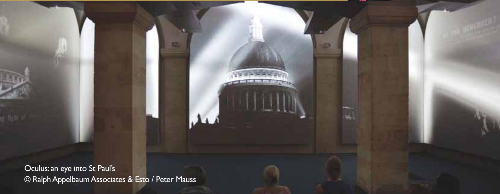
Oculus: an eye into St Paul's

The doors at the west end of St Paul's Cathedral proclaim Jacob's famous words: "This is none other than the house of God, this is the gate of Heaven". Words of promise to all who visit us and a challenge to those who work here. The challenge is that of making every visit a potential encounter with the love and the beauty of God. It is a challenge that is embraced by clergy and laity alike as we welcome people on visits, pilgrimages and for worship.