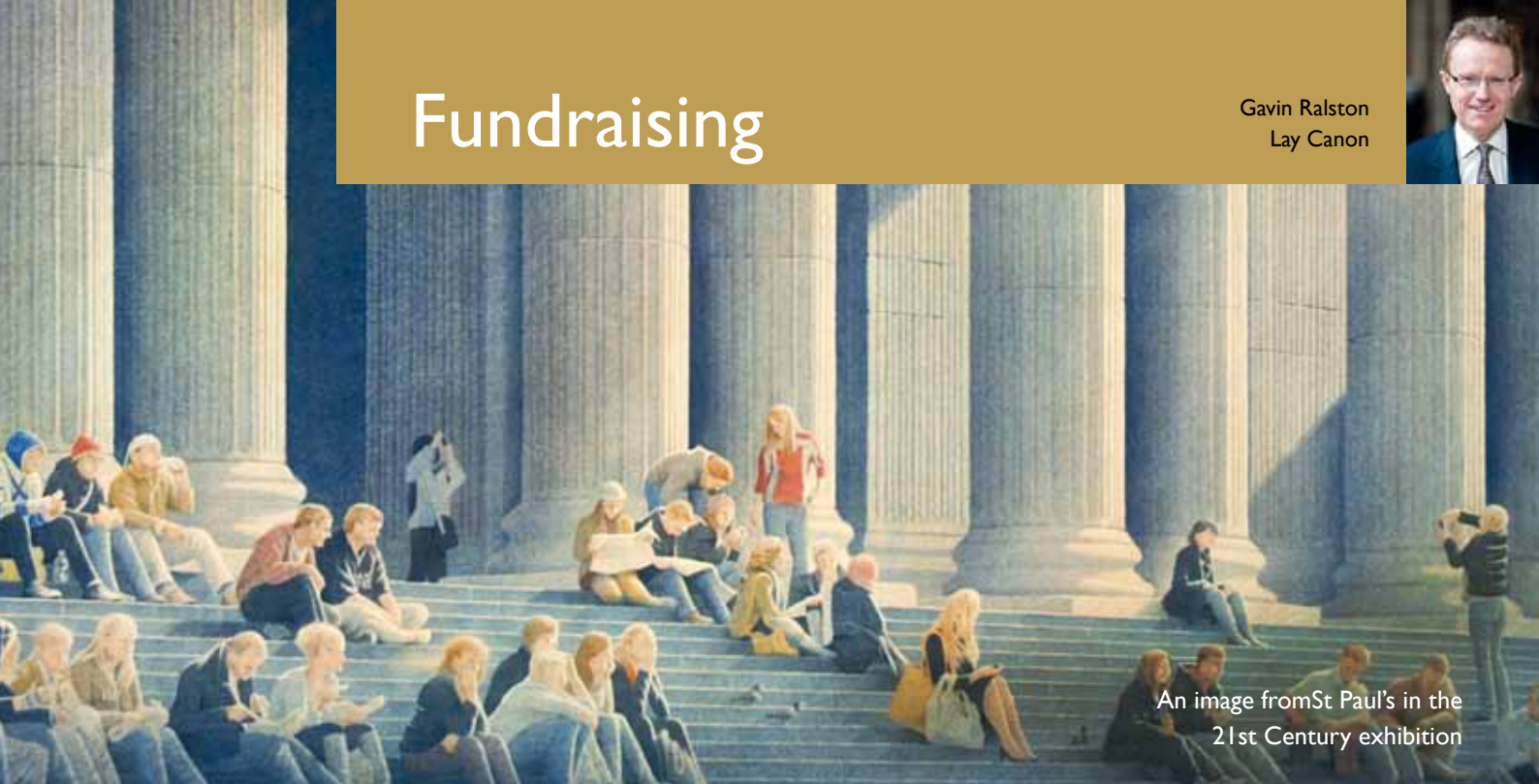
An image from St Paul's in the 21st Century exhibition

Following the completion of the major campaign for the restoration of the building, the Foundation is now concentrating its fundraising activity on ongoing activity such as music in the cathedral, and educational and outreach projects, but also two further capital projects: namely the multi-million pound Triforium and Library project within the overall Interpretation scheme, and finding the remaining £3.5 million needed for the renovation of the Chapter House. In the case of the latter, the Foundation has already contributed funds to enable essential preliminary work to begin and we have formed a fundraising committee jointly with our US affiliate, the St Paul's Cathedral Trust in America (SPCTA), under the overall chairmanship of Lord Blair and with assistance from SPCTA's indefatigable chairman, John Harvey. As the North Side Club of corporate and other supporters comes to an end, we have plans to set up a Chapter House Club along similar lines so that the building is no longer the ugly duckling of Paternoster Square, but can both be restored to something closer to Wren's original design and can provide a much better working environment for the cathedral's staff.