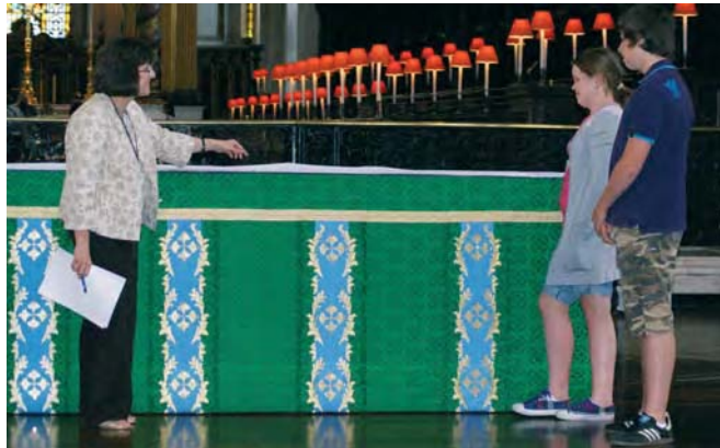
The Dome Altar

The Schools & Families Department offers a wide range of themed, experiential, guided visits . The following pages outline exactly what is on offer. Our visit programmes link with: