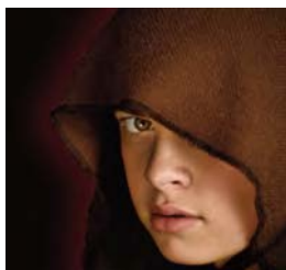
Dress as a monk!