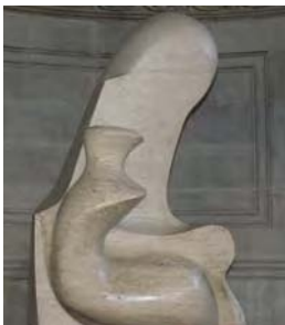
Mother and Child by Henry Moore

St Paul's Cathedral Schools & Families Department