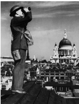
St Paul's Fire Watch

'The Cathedral must be saved at all costs!' this was the telephone message given to the London Fire Brigade by Sir Winston Churchill, Prime Minister during the Blitz.