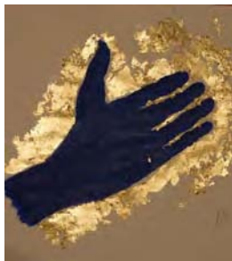
Art and Design