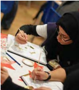
So many activities!