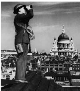
Bring your history alive