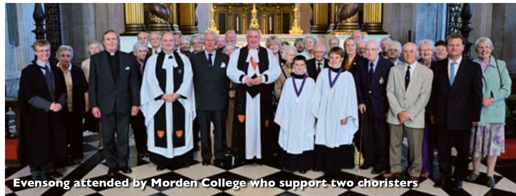
Evensong attended by Morden College who support two choristers