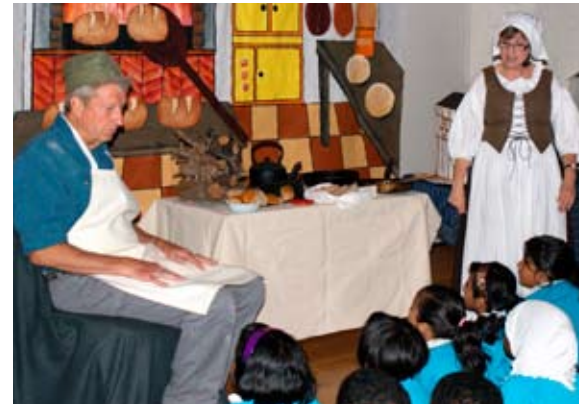
Master Farriner the Pudding Lane Baker and Matilda the maid tell children about how the Great Fire began in 1666 in one of our Education workshops

The Schools & Families Department welcomes some 27,000 school children from across London and the United Kingdom to the cathedral each academic year. We offer a lively and exciting range of activities that aim to bring alive the history of the cathedral and its role as a place of worship for all.