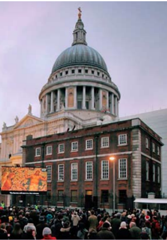
The Chapter House as backdrop to the screen broadcasting the 2010 Christmas Carol Service, sponsored by Lloyds Banking Group

Earlier this year we started our fundraising campaign to raise the £4.5million required to renovate completely St Paul's Chapter House. This grade II* listed Wren building is the administrative heart that supports the whole enterprise and mission of the