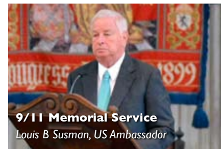
9/11 Memorial Service Louis B Susman, US Ambassador