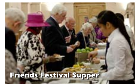
Friends Festival Supper