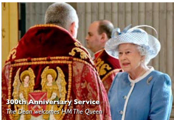
300th Anniversary Service The Dean welcomes HM The Queen