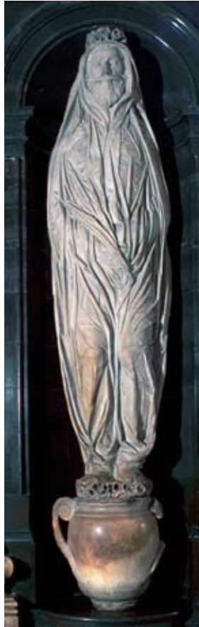
Pre-1666 effigy of John Donne in the Dean's Aisle, from the workshop of Nicholas Stone

By 1621 when Donne became Dean, it was felt that sermon-hearing had become a kind of spectator sport enjoyed for the accomplishments of the preacher's eloquence and artfulness, rather than the listeners' moral edification; and, even more importantly, that the 'cult of the sermon' had pushed aside the far more vital, and reliable, conduits of God's grace: prayer, and the sacraments, or, in short, liturgical worship. While the redundant nave had gone to rack and ruin, the quire of the cathedral had always been kept in good repair by the Dean and Chapter. And it was there too that some of the first and grandest post-Reformation