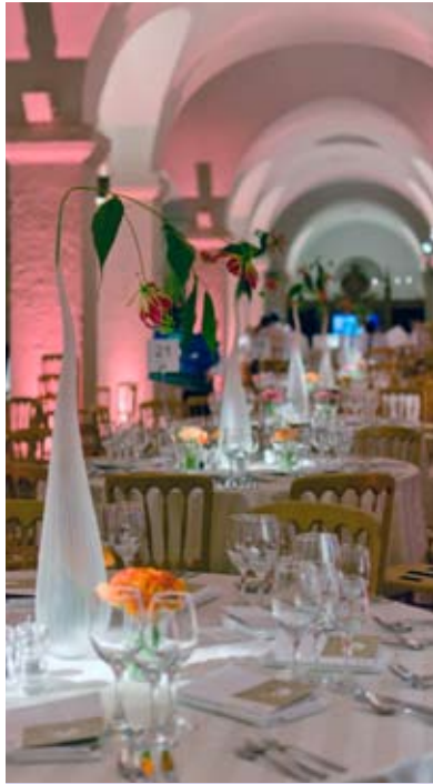
The Crypt as venue for the Gala dinner and auction