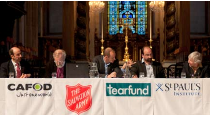
The St Paul's Institute debate on the Robin Hood Tax took place in March of this year