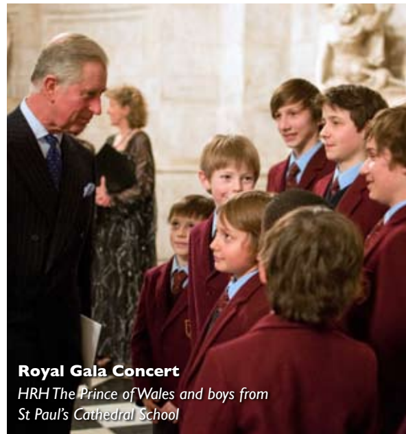
Royal Gala Concert HRH The Prince of Wales and boys from St Paul's Cathedral School