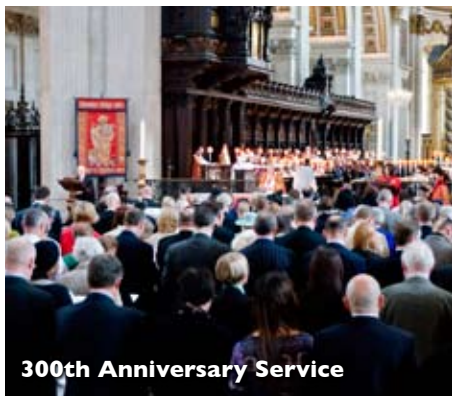
300th Anniversary Service