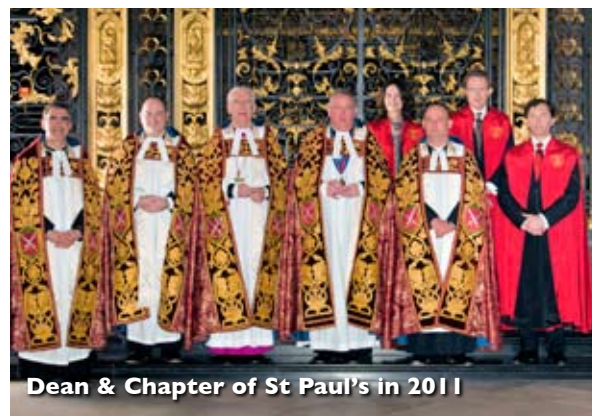
Dean & Chapter of St Paul's in 2011