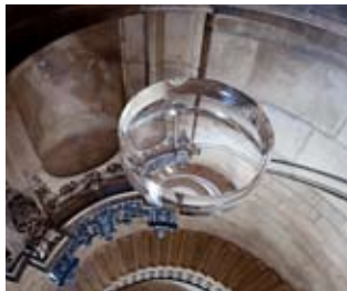
Perspectives by John Pawson for Swarovski Crystal Palace

Visiting Hours: Until late 2011 (closed Sundays) regular guided access throughout the day will be available to visitors during sightseeing hours. Requests outside of these hours by prior arrangement only. Contact pr@stpaulscathedral.org.uk for information about out of hours access to the installation. For all other visits queries contact visits@stpaulscathedral.org.uk