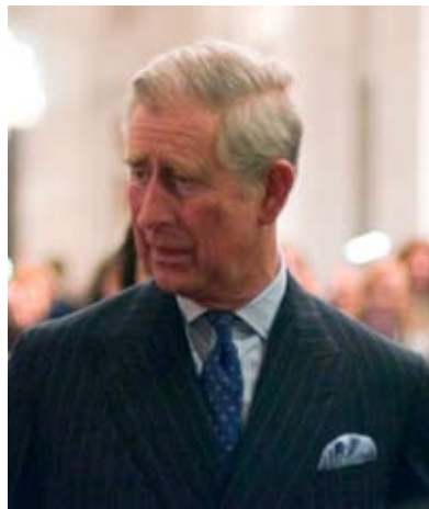
HRH The Prince of Wales at the Concert