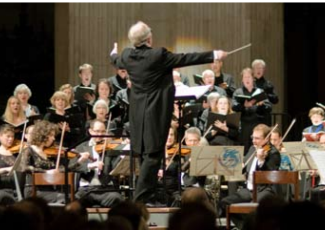
John Rutter CBE conducts the Orchestra at the Royal Gala Concert

Be sure to make a diary note now of the next Gala Concert scheduled for Thursday 7 February 2013!