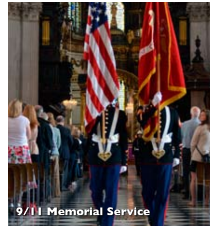
9/11 Memorial Service