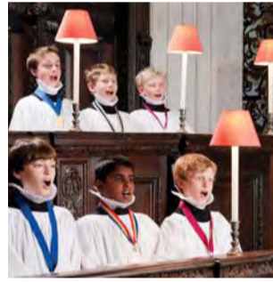
The Cathedral Choir