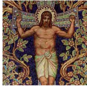
Crucifixion as the Tree of Life: mosaic by William Blake Richmond north-east quarter dome (detail)