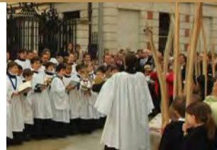
Palm Sunday procession begins in Paternoster Square