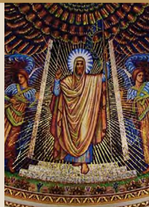
Resurrection of Christ: mosaic by William Blake Richmond South East quarter dome (detail)