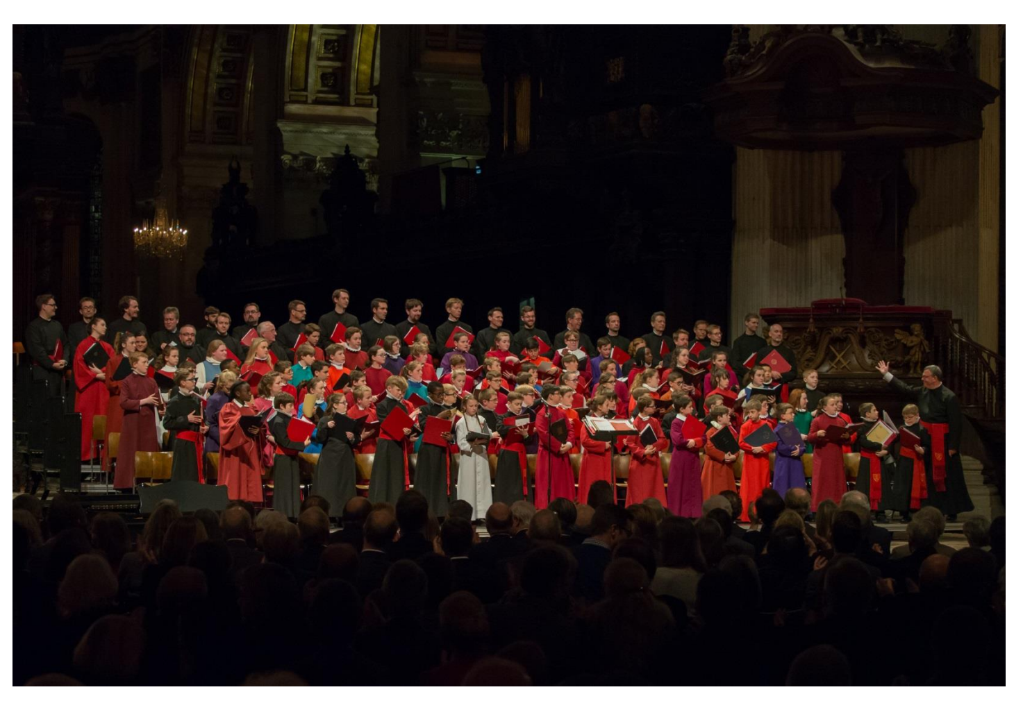
Choristers from cathedrals across the UK sing at the Diamond Fund for Choristers concert, May 2016