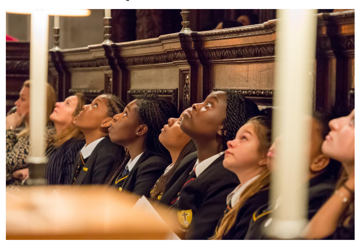
Young women at the St Paul's Institute and Girls Talk London event, October 2016