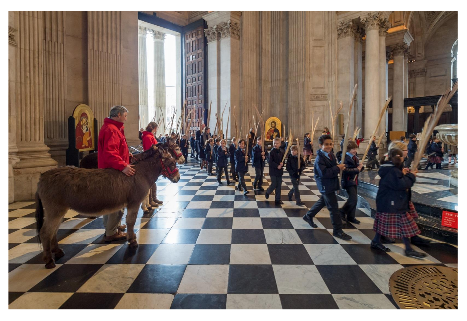
Pupils from the Cathedral School in the Palm Sunday procession, March 2016